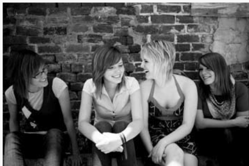
Hailing from Springboro, Ohio, the young women of Vanity Theft are both band mates and best friends. They believe honesty and appreciation are essential to maintaining their friendships.

Girls need to stick together, and these girls from Springboro, Ohio, can show you how it's done. As best friends and band mates, they offer advice on having and holding onto girlfriends.